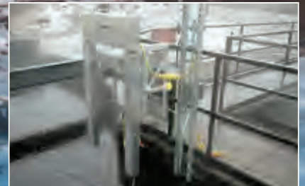
Frame Mounted or Hanging Systems