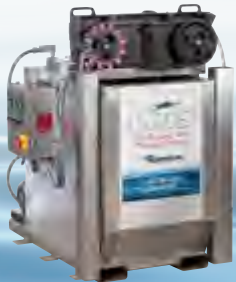
ORTS® Oil Removal and Transfer System

Model 6V is available with all of our oil skimming systems: