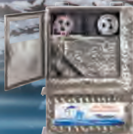
6Vh™ Enclosed Skimming System