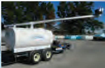
Extended Reach or Mobile Systems