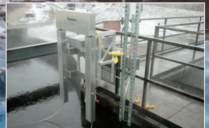
Frame Mounted or Hanging Systems