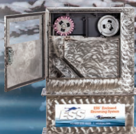
ESS™ Enclosed Skimming System