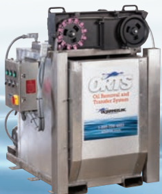
ORTS® Oil Removal and Transfer System

Model 6V is available with all of our oil skimming systems: