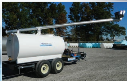
Extended Reach or Mobile Systems